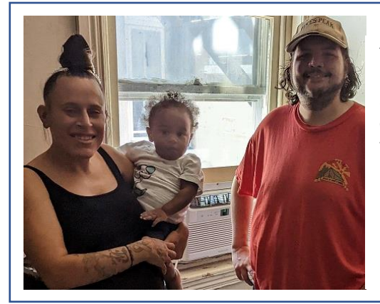
The Knights provided yet another air conditioning unit for a needy mom keeping her baby. Great job. P.S.: We still need more air conditioners .

There's so much information to put out this month about the Council I will keep my submission short this month. I want to thank everyone for their support in the last two